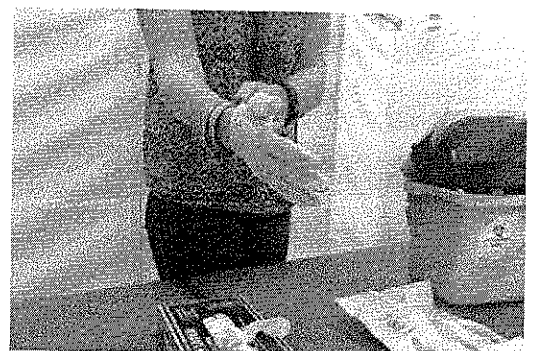
PHOTO: The study results will help medical professionals save on costs.